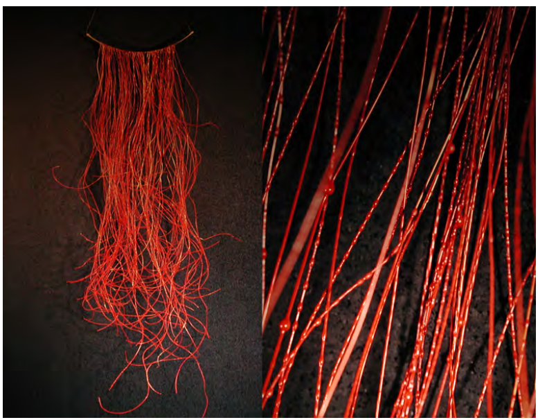
(Left) Image of Cinnabar, necklace, 20KYG, urushi, 1000 \times 600 \times 100 mm. 1993. (Right) The detail of the same work.

In 1993, I held my first solo jewelry exhibition, Image of Cinnabar, The fragment of time-1, at Gallery IF, which is now closed. The exhibition highlighted lacquer works, and one of the exhibits was a necklace. For this, I hung 0.3-mm-thick metal wires from the ceiling and encrusted the surfaces with dripping urushi lacquer. I put them together into a bundle and made a necklace so that the wires would hang nicely in front of the wearer's body. I wanted to show an intriguing texture created by the counteraction of the urushi lacquer against gravity. The work came about by accident in my studio. I happened to hit metal pieces with a brush loaded with urushi lacquer, which eventually hardened into drops. The sight of the beautiful shapes prompted me to develop them into a proper body of work.