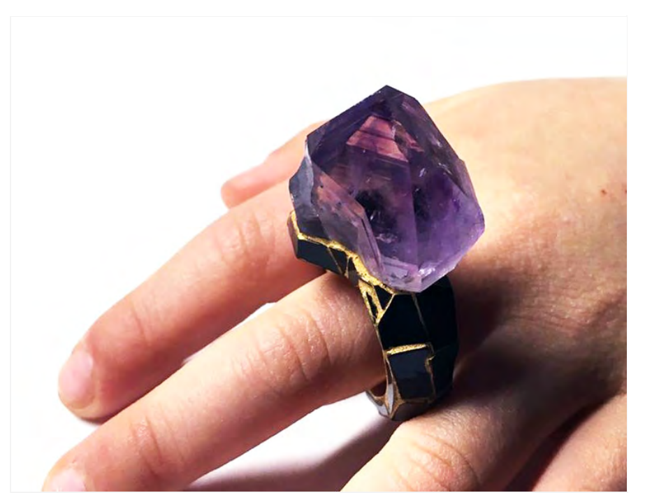
KAMO RIVER, a ring on Nana's finger, 300 years old urushi, 20KYG, pigment of cinnabar, fine gold pigment, amethyst crystal, epoxy resin, 25 \times 45 \times 25 mm, 2016.

INTERVIEW / Artists, Critical Thinking, 日本語版 - Japanese Version