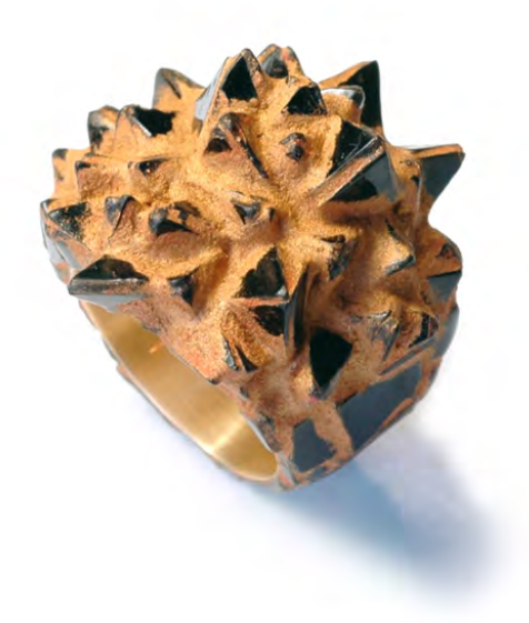
KAMO RIVER, ring, 300 years old urushi, 20KYG, pigment of cinnabar, fine gold pigment, epoxy resin, 35 \times 40 \times 30 mm, 2016.